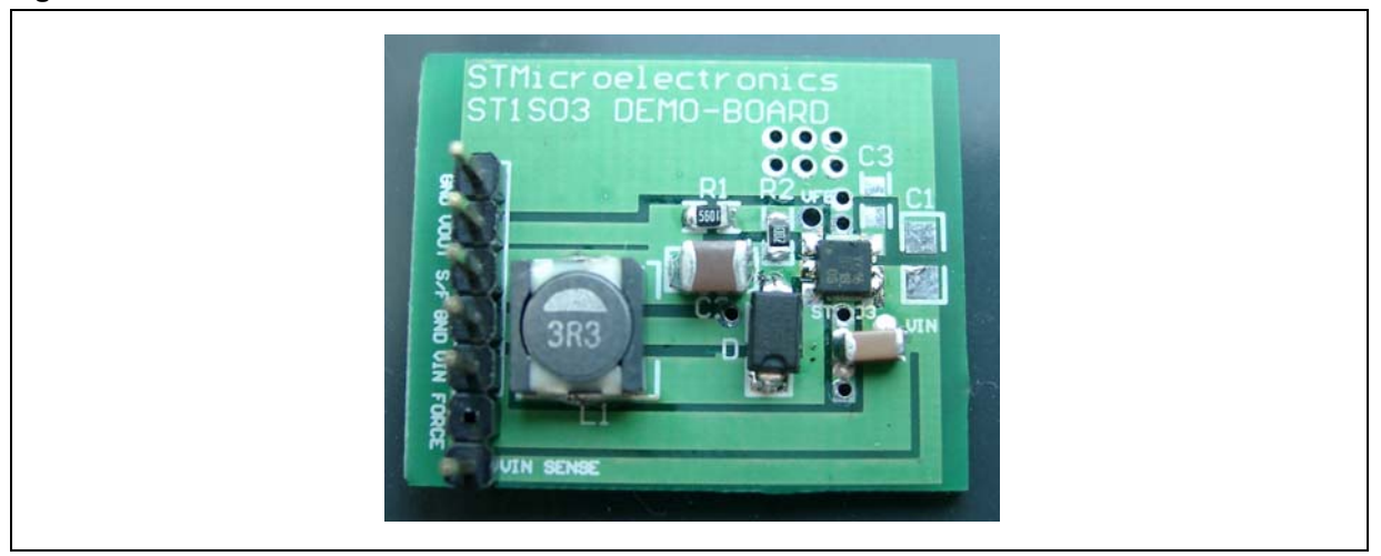
Figure 1: Assembled Board

The ST1S03 is a step down DC-DC converter optimized for powering the low-voltage digital core in HDD applications and, generally, replacing the high current linear solution when the power dissipation may cause excessive heating of the application environment. It provides up to 1.5A over an input voltage range of 3V to 16V. A high switching frequency (1.5MHz) allows the use of tiny surface-mount components, as well as the use of a resistor divider to set the output voltage value. Only an inductor, a Schottky diode and two4capacitors are required. Besides, a low output ripple is guaranteed by the current mode PWM topology and by the use of low E.S.R. SMD ceramic capacitors. The device is thermal protected and current limited to prevent damages due to accidental short circuit. The ST1S03 is available in DFN6 (3x3) package.